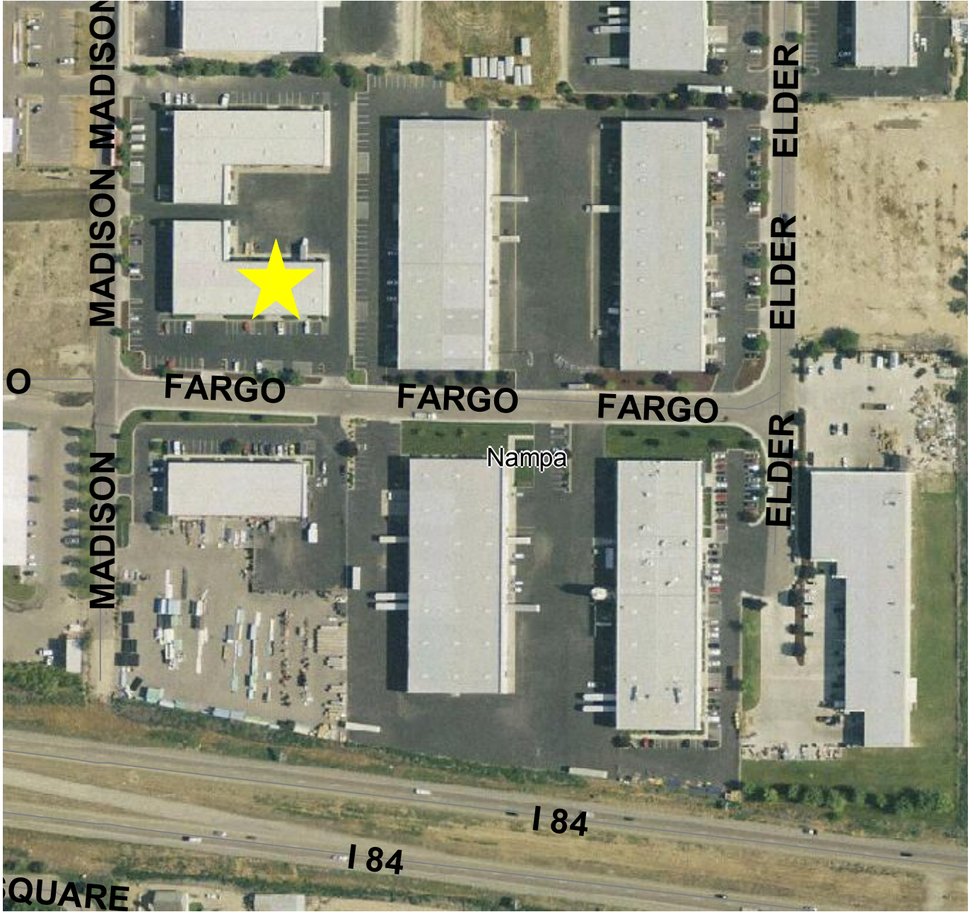
Close-up aerial photo